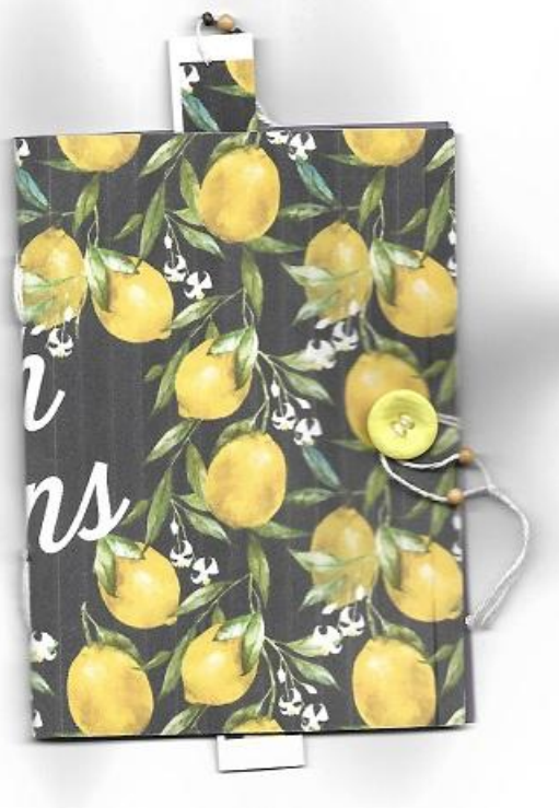
The volunteer Nazli's prototype from the Creative Workshop for manual book binding

Links to the video production of the projects: